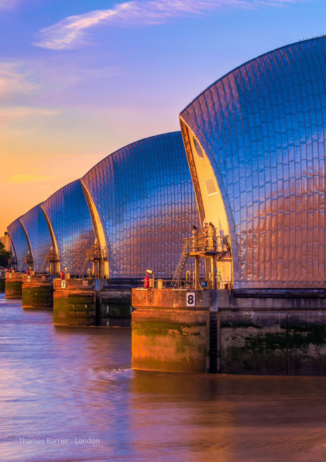
Thames Barrier - London