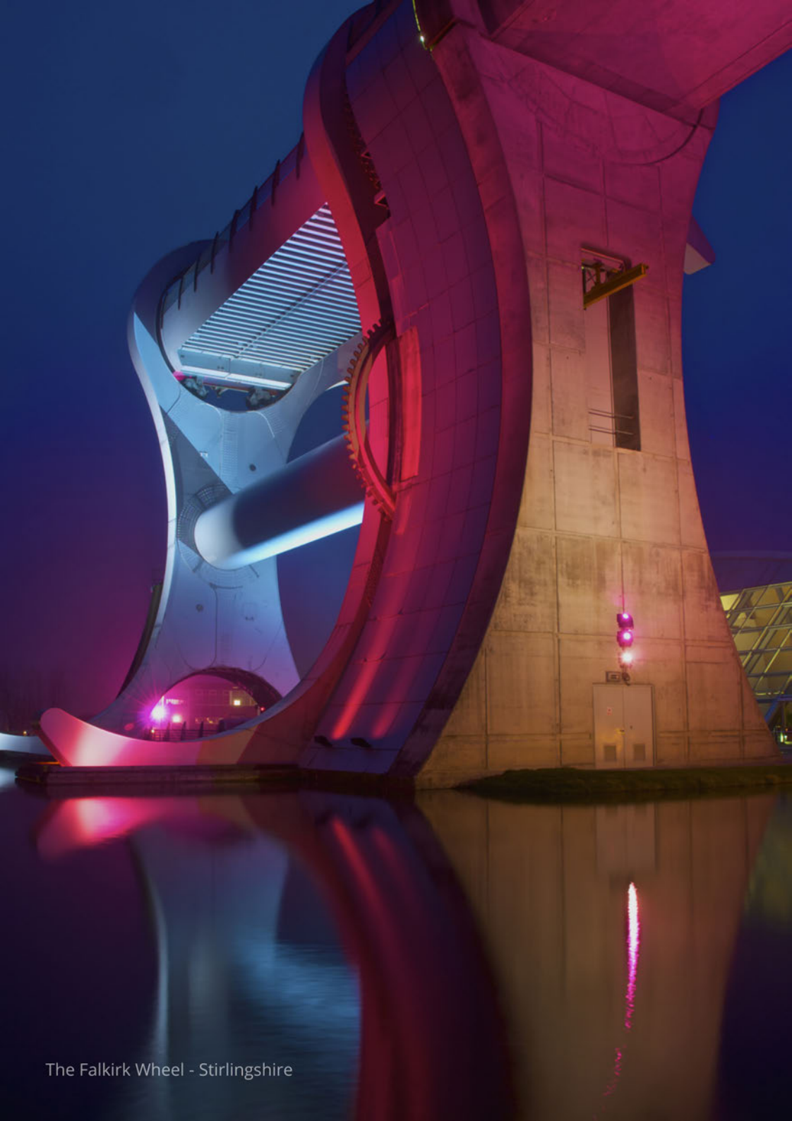
The Falkirk Wheel - Stirlingshire