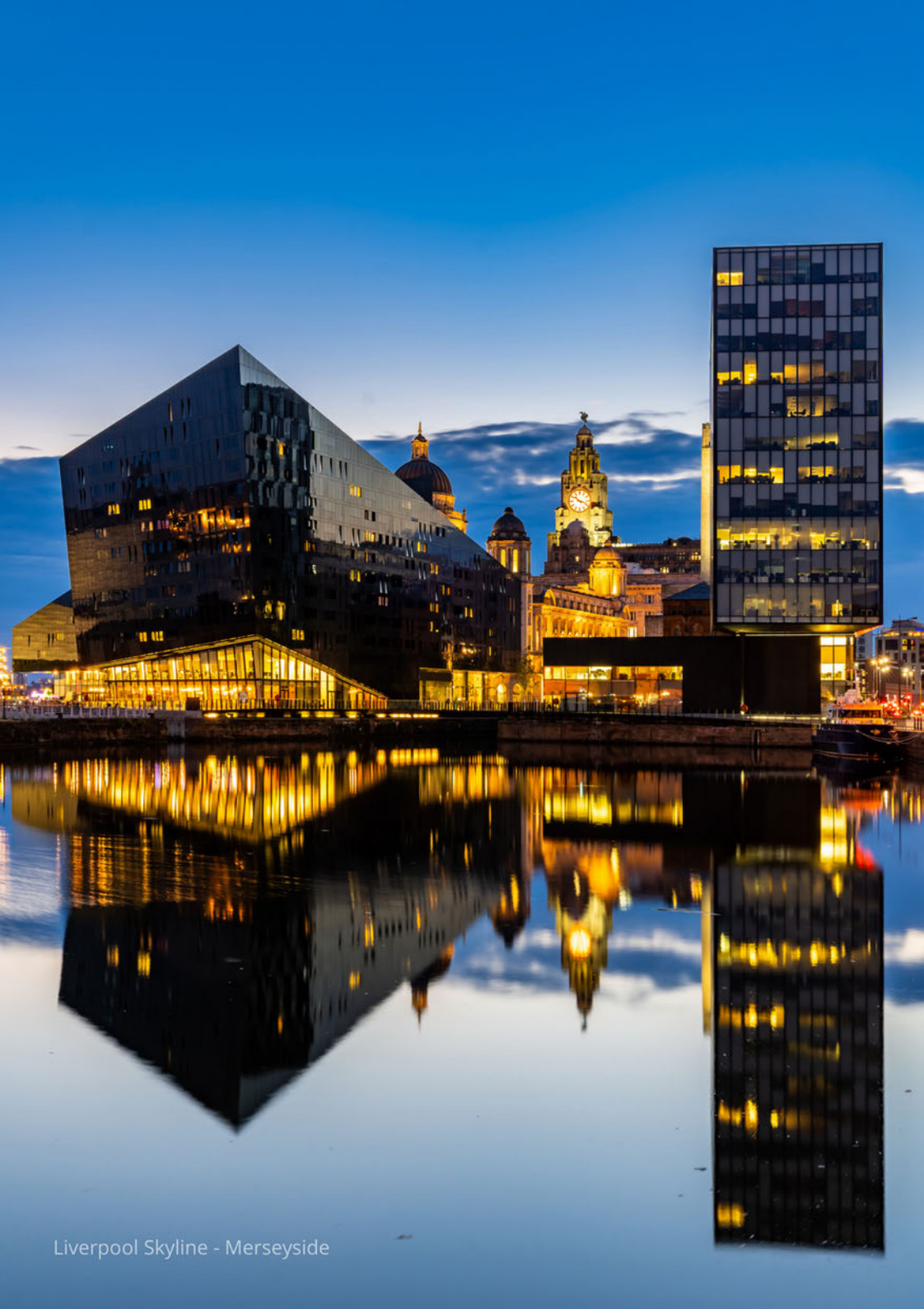
Liverpool Skyline - Merseyside