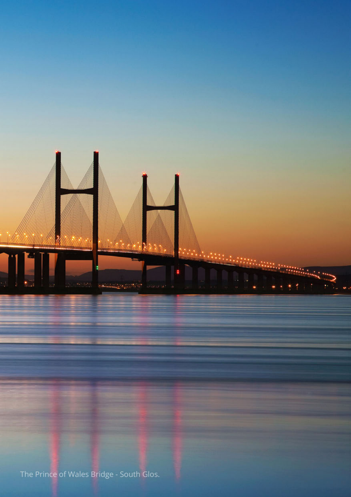
The Prince of Wales Bridge - South Glos.