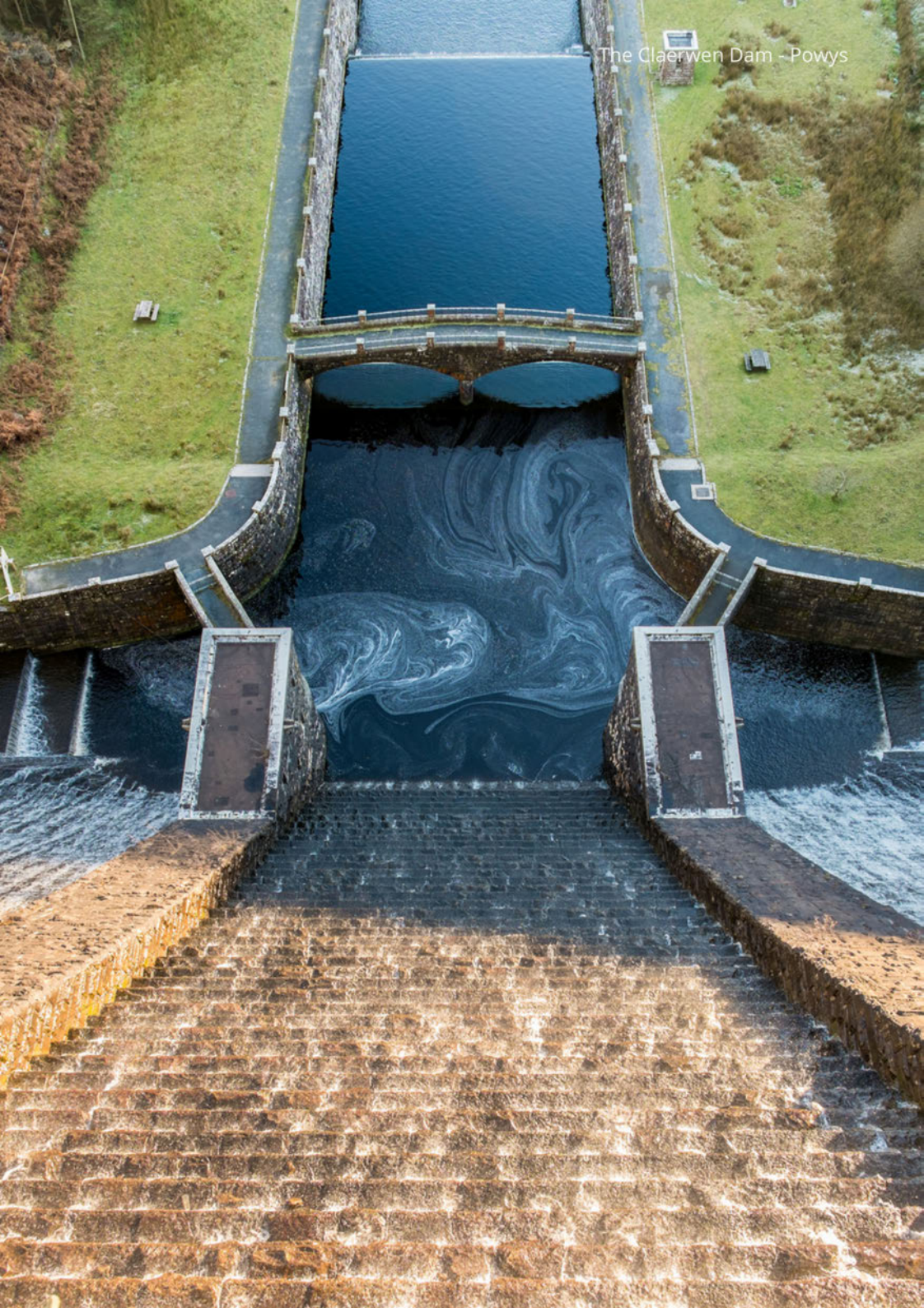
The Claerwen Dam - Powys